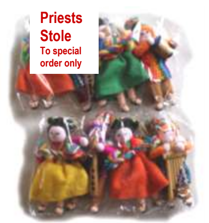
Woven figures Instrumentalists (pipes, guitar, drum)