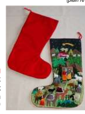
Christmas Stocking Approx 440 mm length x 300 mm foot width (plain reverse side)